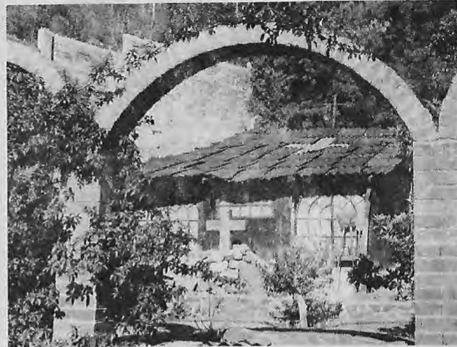
Where the first Minim brothers lived before their monastery was built.

Here, holy Communion was placed on my tongue, and then Jesus said to me: "Do not fear anything. You also, will you not obey Me?"